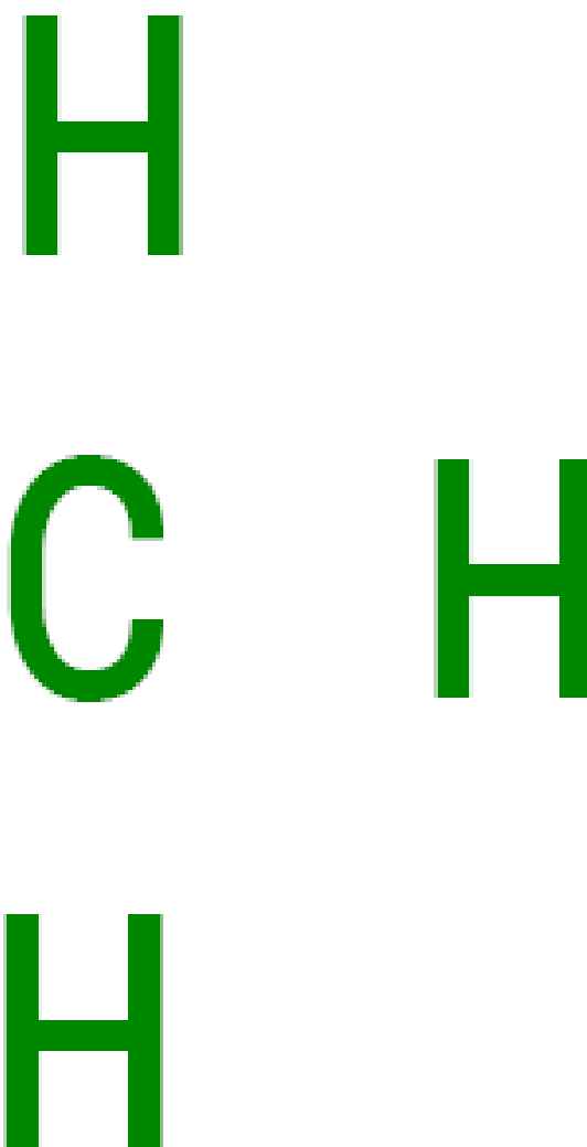
Figure 14.1 A methyl group.

While it may sound complicated, methylation is simply the biochemical process of adding a methyl group to a molecule. A methyl group consists of a carbon atom surrounded on three sides by hydrogen atoms, allowing